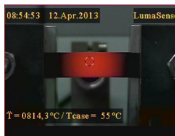
Example video image