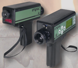
Portable Pyrometer IS8-GS pro