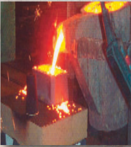
Filling the casting mould