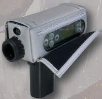
Heat protection bag against radiation heat