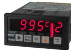
Temperature Display at Controller