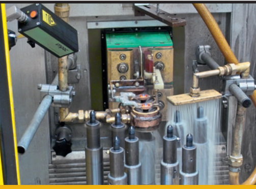
Measurement in Hardening Processes

the workpiece, enabling further insight into the hardening process. While pyrometers provide accurate and precise temperature measurements at a single fixed point and enable the reproducibility that is critical in induction hardening processes. In addition, pyrometers are capable of very fast measurement speeds which is required for the rapid thermal changes of the induction process. The use of pyrometers, thermal imagers, and fast controllers for temperature monitoring and process control can increase the quality, accuracy, and repeatability of many heat treatment processes.